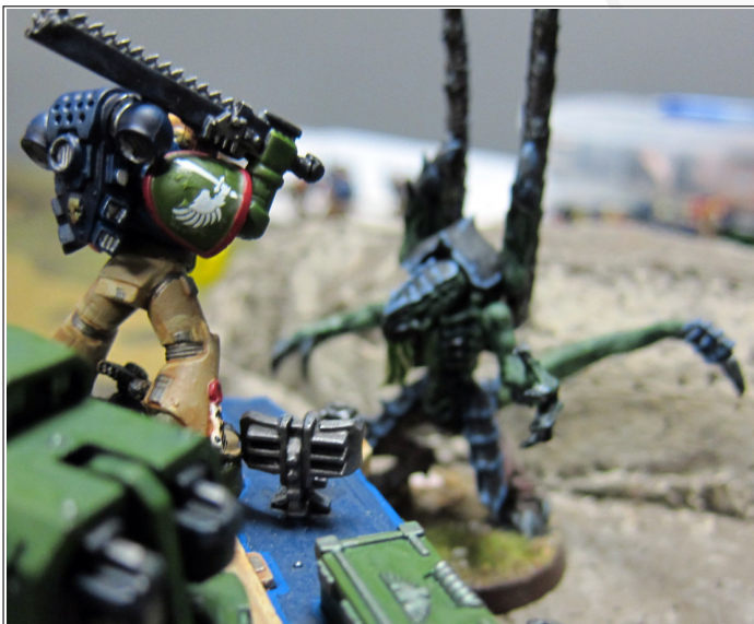
For the Emperor.